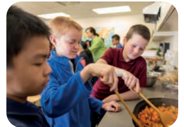
Photo of children cooking

Also learn some helpful nutritional tips. Please let us know if you have any dietary requirements.