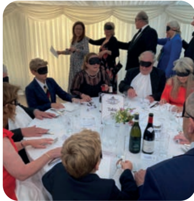
Photo of Dining in the Dark