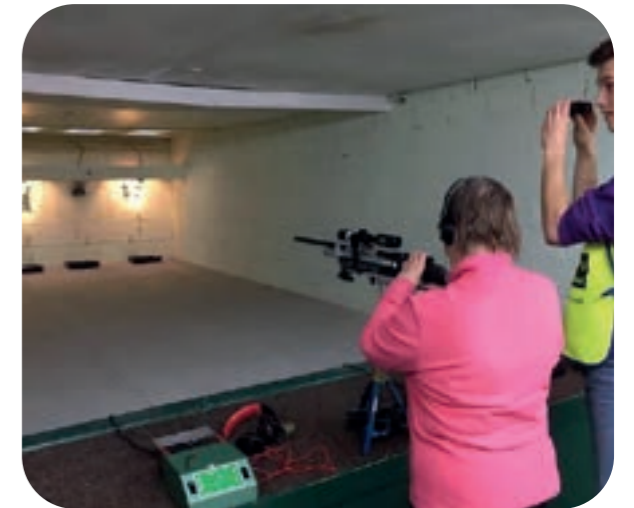
Photo of child at the shooting range

A great opportunity to learn more about different Visually Impaired sports, including cricket and acoustic rifle shooting. A representative from the Duke of Edinburgh Award will be in attendance to explain more about the support that is available for anyone doing your DofE. Free to attend, light lunch included.