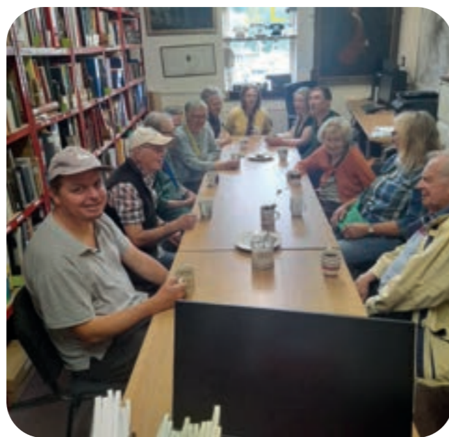
Photo of Frome Social Group

Since forming just a few months ago, so far this year they have been to Shearwater Lake, Frome Museum and Southwick Country Park, with other trips planned.