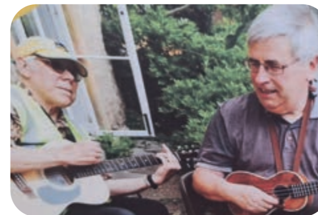
Photo of Guitar Club

Alternate Mondays. Informal and fun to learn new songs.