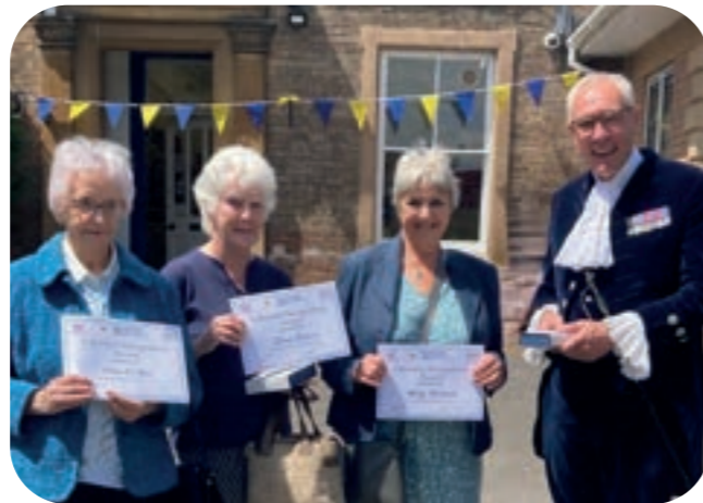
Photo of the Volunteers receiving their long service award certificates