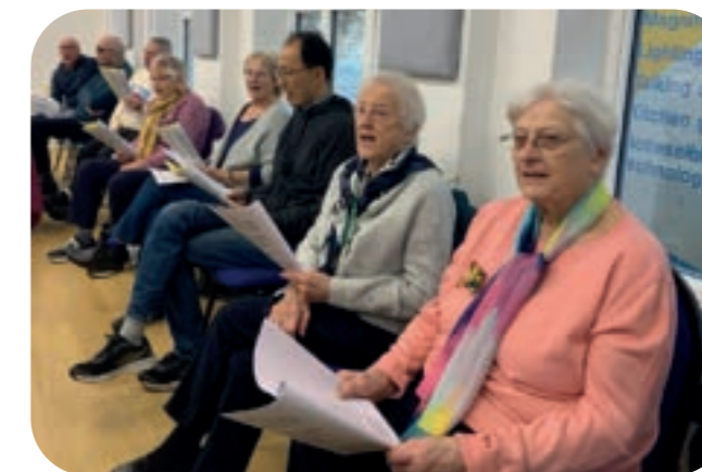
Photo of Singing Group

Every Friday. Try a new craft or continue with own project.