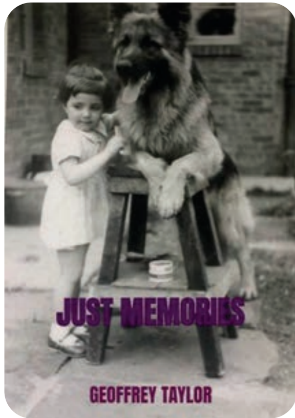
Photo of Just Memories Book Cover