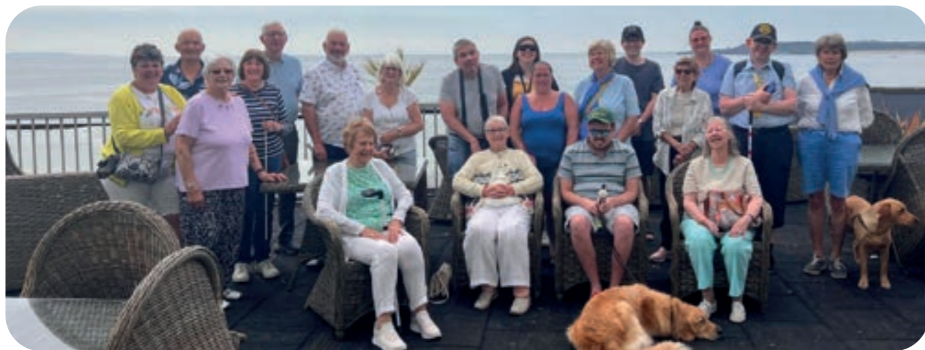
Photo of the Tenby Group