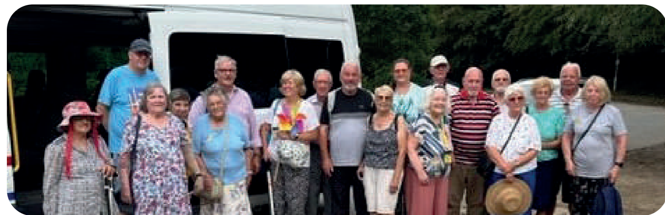
Photo of Yeovil Social Group

planning trips. This year they have been to Sidmouth, Weymouth, planned their Christmas meal and looking at events and outings in 2025. The group has brought lots of people together who also sometimes socialise outside of the group meetings.