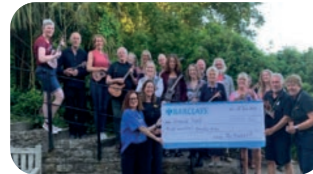
Photo of Frukés Cheque presentation