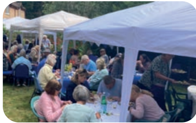
Photo of the Summer Party