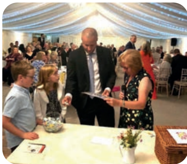
Photo of Children selling raffle tickets

Once seated, how do you know if the wine bottle contains red or white wine? Where is the glass – how do we pour without spillage? What's this on my plate? You have to work out what you are eating and where it is on the plate.