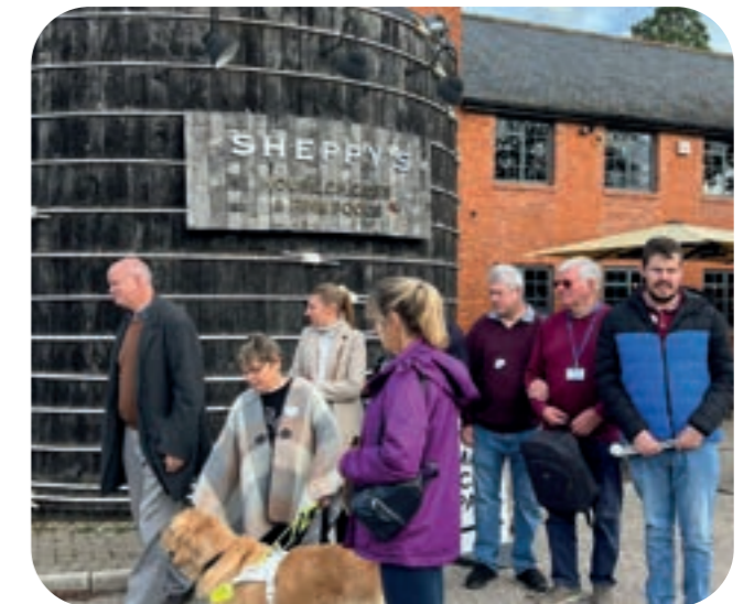
Photo of the Sheppy's Cider