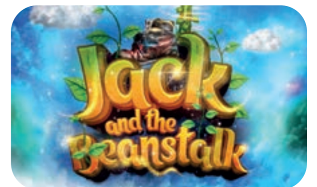
Photo of Jack and the Beanstalk

Cost: £10 per child, 1 free Essential Companion per visually impaired child, £24.50 per adult.