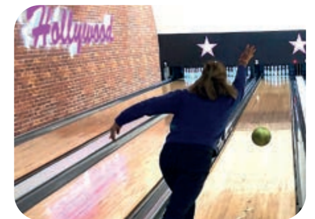
Photo of the Ten Pin Bowling

Bowling starts 12pm at both venues. £7.50 per person for two games each