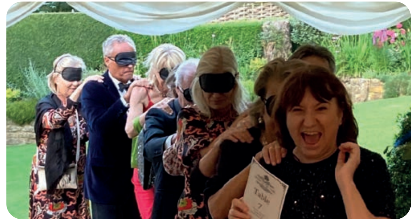
Photo of Guests wearing blindfolds and being led in to dinner